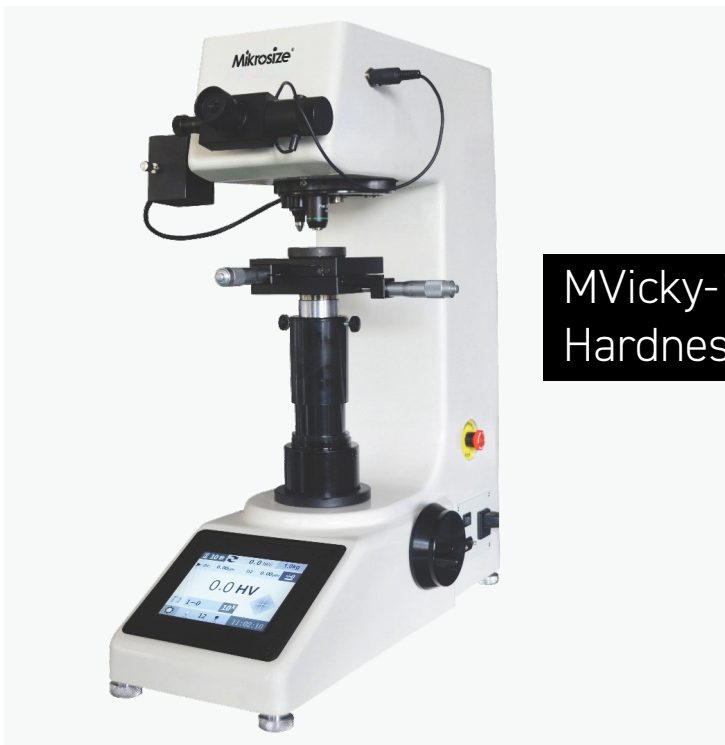
MVicky-10T/50T Touch Screen Macro Vickers Hardness Tester