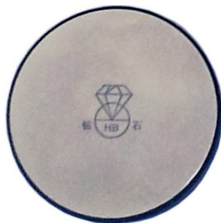
Macro Vickers Hardness Block