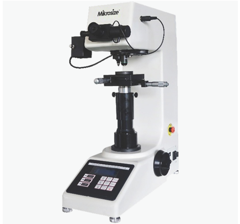
MVicky-10D/50D Digital Macro Vickers Hardness Tester