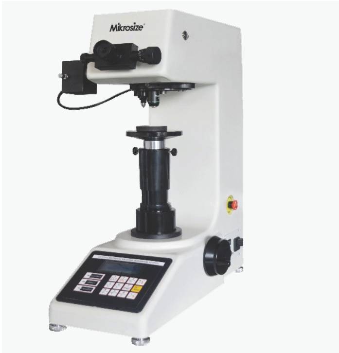
MVicky-10/50 Manual Macro Vickers Hardness Tester