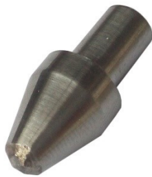
Macro Vickers Indentor