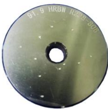
HRB Hardness Block