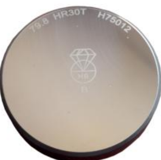
Superficial Rockwell Block