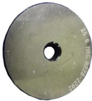
HRC Hardness Block(Low)