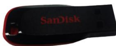
USB Flash Disk