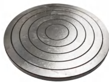
150mm Flat Test Anvil