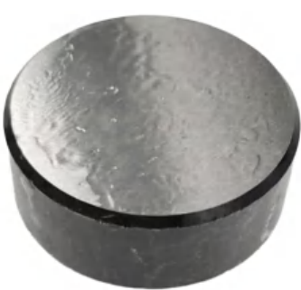
55mm Flat Test Anvil