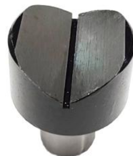
40mm V-shape Test Anvil